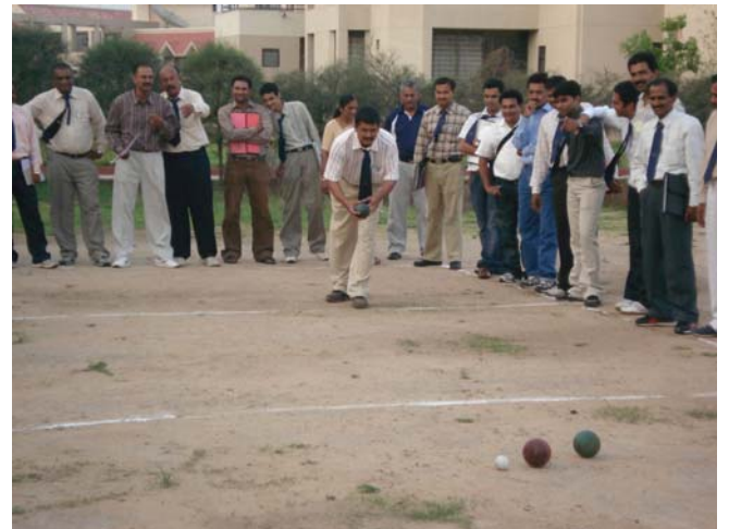
[ Bocce Practical Game]