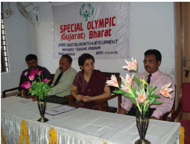
Opening Ceremony ( 19th July, 2008)