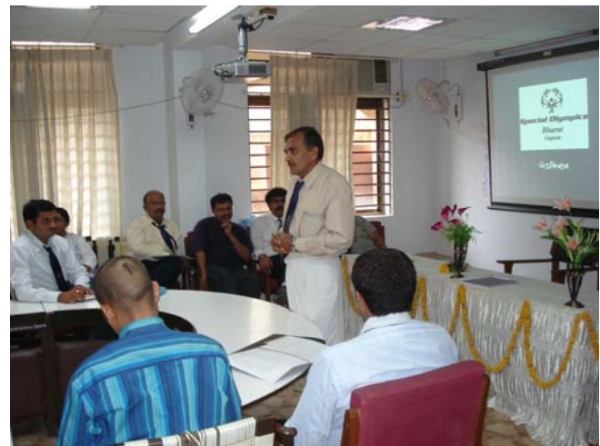
Badminton Lecture Taken