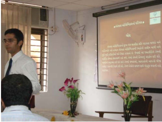
Overview of Special olympics By Jignesh Thakkar ( Anand)