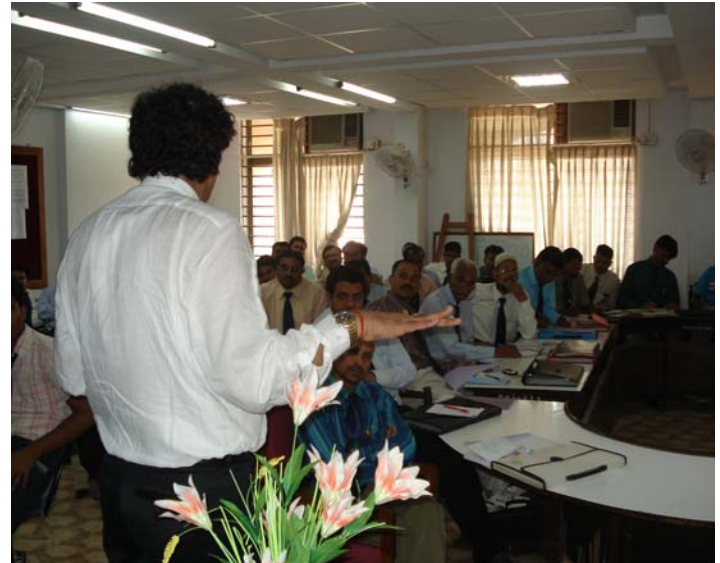
[Sarva Shiksha Abhiyan Planner 2008 By Prof.D.G.Chaudhary]