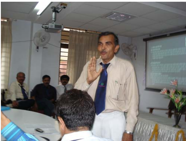
Table Tennis Lecture