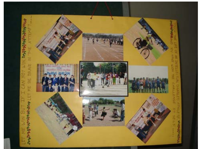
[Public Awareness Bulletin Boards]