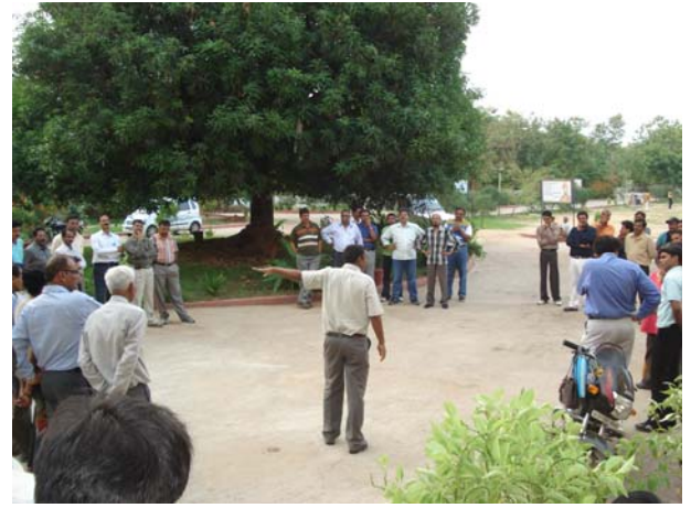
(Fellowship & Games)